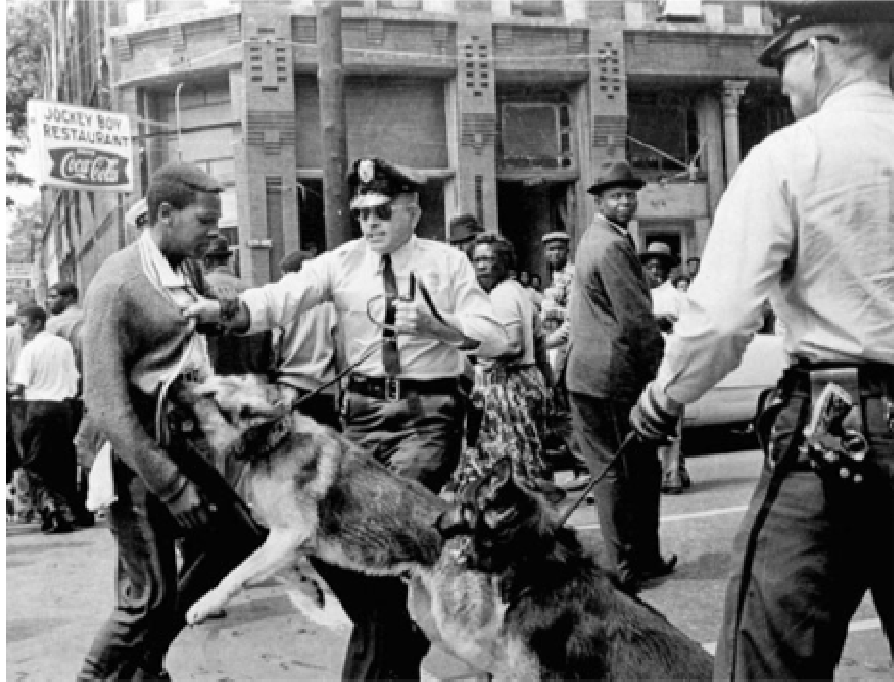
Dogs Attacking Birmingham Black Citizens in 1963

http://www.rethinkingschools.org/img/archive/20_02/RS_20_02_51.jpg