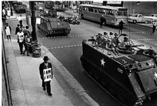
March 29, 1968: Scene in Memphis

In contrast, Maynard Jackson quickly demonstrated that he was not beholden to or a leader of the Black population that elected him, but beholden to those who financed his election campaign and who helped his personal political and financial advancement. In Atlanta, Jackson, instead of helping city sanitation workers, fired more than a thousand city employees to crush their strike. In this, he had the support of white business leaders and the Atlanta Journal-Constitution.